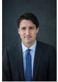
The Rt. Hon. Justin P.J. Trudeau, P.C., M.P. Prime Minister of Canada